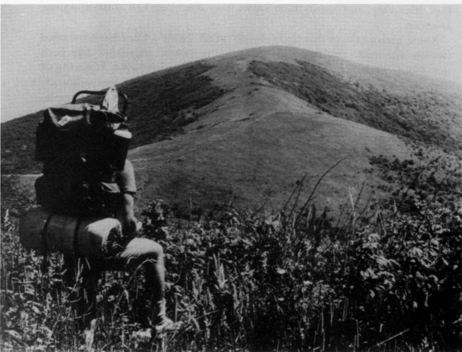
74 A 'bald' in the southern Appalachians

Backpackers will find a chain of lean-tos, three-sided shelters, at intervals of about a day's hike along most of the Trail. The majority of these are near water and have a fireplace. However, with increasing use of the Trail, the hiker may find a shelter full and the firewood gone. It is advisable to carry emergency shelter, water and a small stove.